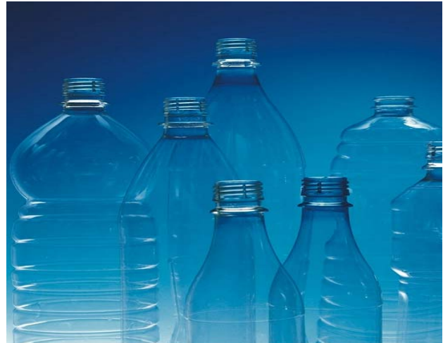
Fig. 4: Plastic bottles

Life today cannot be imagined without a multitude of products which can only be produced using compressed air.