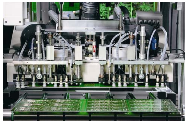
Fig. 8: Circuit board production

The electronic industry can be cited as an example, where production depends on absolute precision with the largest possible output. In accordance with "clean production", extremely precise, very small vacuum pumps ensure the exact handling of electronic circuit boards under clean-room conditions and their fitting with microchips. The stable, controlled vacuum "grasps" the chip and positions it at exactly the right place on the printed circuit board.