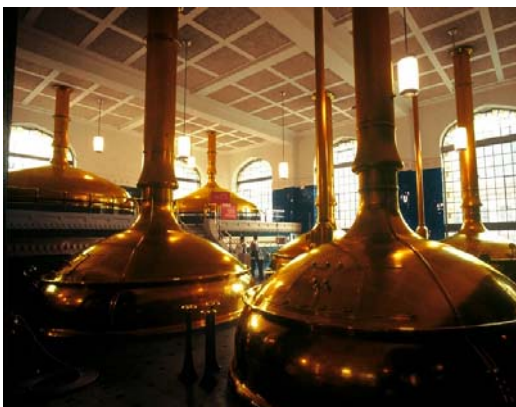
Fig. 7: Fermenting and bottling

If compressed air is directly incorporated as a process medium in certain processes, then it is called process air. Common areas of application are drying processes, the aeration of clarifiers or air for fermentation processes.