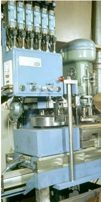
Fig. 2: Automation using compressed air

The speed, precision, flexibility and miniaturisation of these components play an important role.