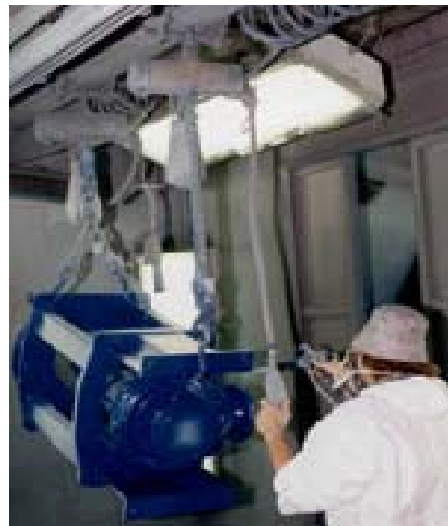
Fig. 5: Explosion-proof mechanical hoist

For example, compressed-air hoists ensure that there are no sparks caused in varnishing plants.