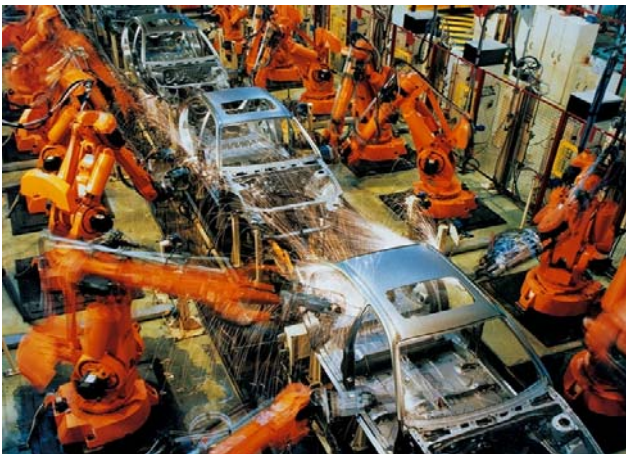
Fig. 3: Robots operated using compressed air

Without compressed air the degree of automation essential for the competitiveness of companies would not be possible.